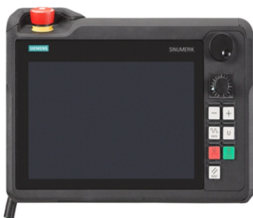
Depiction of handheld control panel HT10

The TGM250 can also be used for all applications of a conventional 3-axis milling machine. Already specified contours (pockets, circles, etc.) can be programmed via the control panel within minutes. Besides the specified contour programs, free programming is also possible.